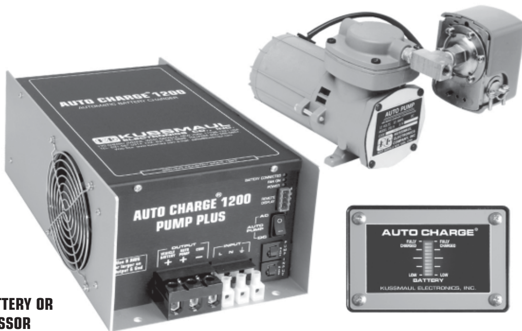
MODEL #091-9-1200 WITH STANDARD INDICATOR

MAY BE OPERATED AS A D.C. COMPRESSOR FROM THE BATTERY OR SWITCHED SO THAT COMPRESSOR WILL ONLY RUN WITH A.C. POWER APPLIED